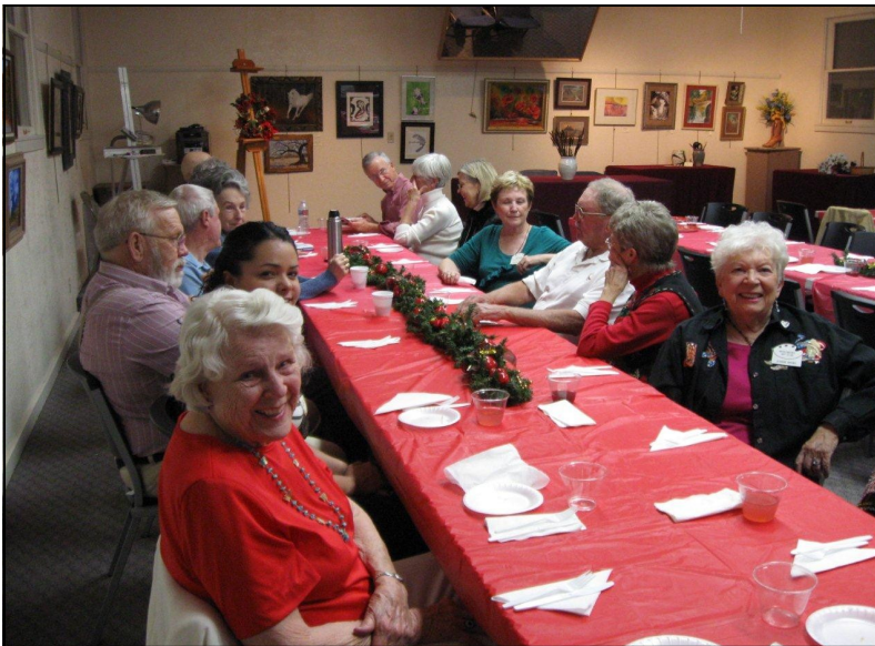
One of the three tables at the Christmas Potluck dinner. These poor folk haven't been able to go get their food yet, but everybody else is loading their plates!