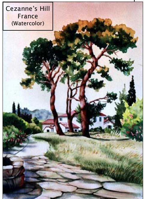
Cezanne's Hill France (Watercolor)