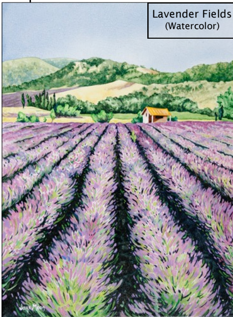
Lavender Fields (Watercolor)

Joye Moon's book, Exploring Texture in Watercolor , published by North Light Books, was released in December 2008. She will have it available to purchase at the class. It is a number one seller in the U.S., Europe, Asia, Australia, and Africa.