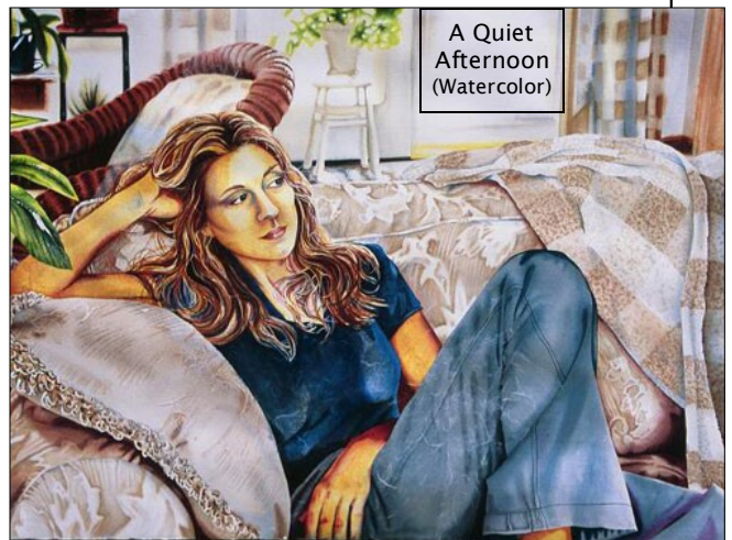
A Quiet Afternoon (Watercolor)